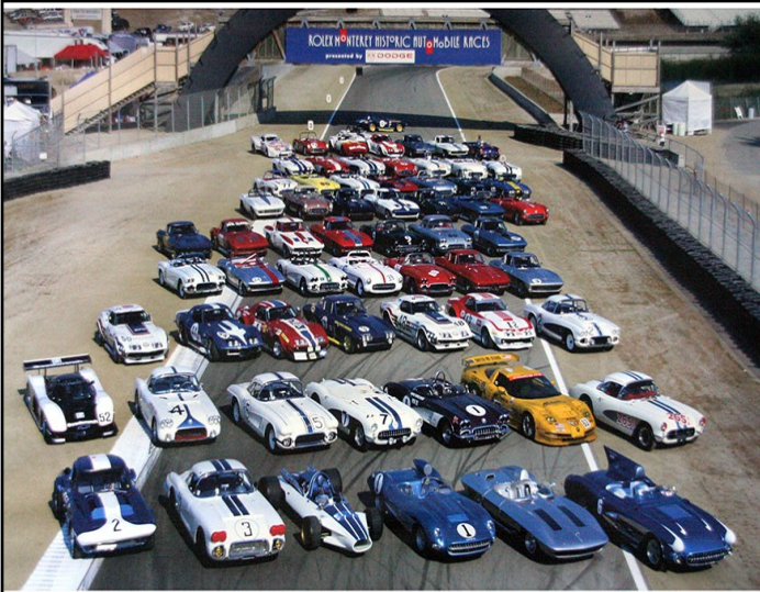
REGISTRY OF CORVETTE RACE CARS >